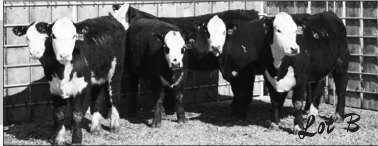
B BWF Commercial Heifers Tags: 603, 644, 653, 611, 646, 955