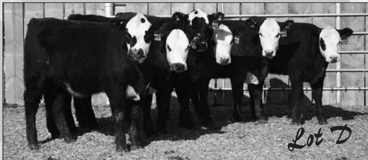
D BWF Commercial Heifers Tags: 652, 662, 619, 670, 667, 659

Thanks for attending the Eighth Annual LaGrand Annual Bull and Female Sale!