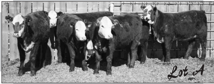
A RWF Commercial Heifers Tags: 604, 613, 647, 655, 653, 620