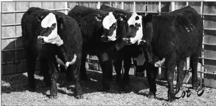
C BWF Commercial Heifers Tags: 617, 654, 668, 638, 633