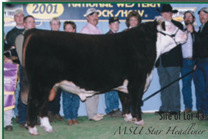
Sire of Lot 43