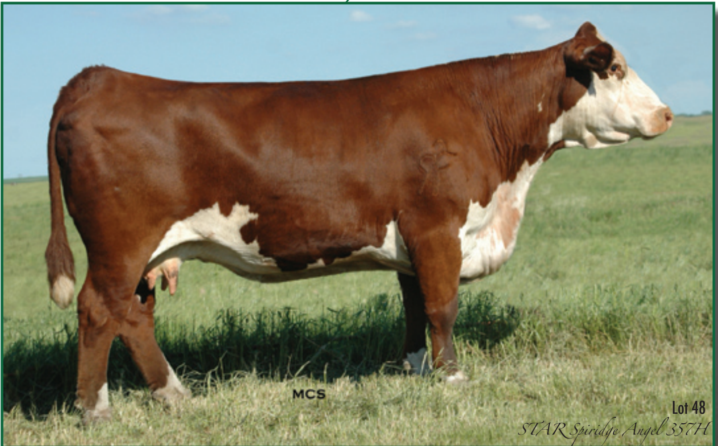
STAR Spiridge Angel 357H