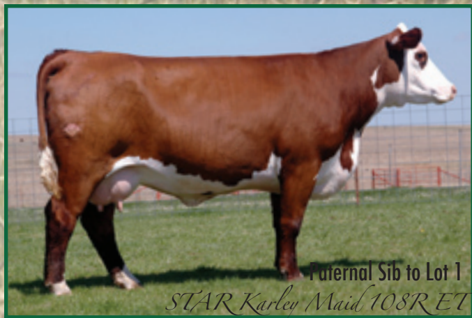
Paternal Sib to Lot 1 STAR Karley Maid 108R ET

4 Frozen Embryos by Patriot. Removal date 11/24/06. Two grade 1, two grade 2.