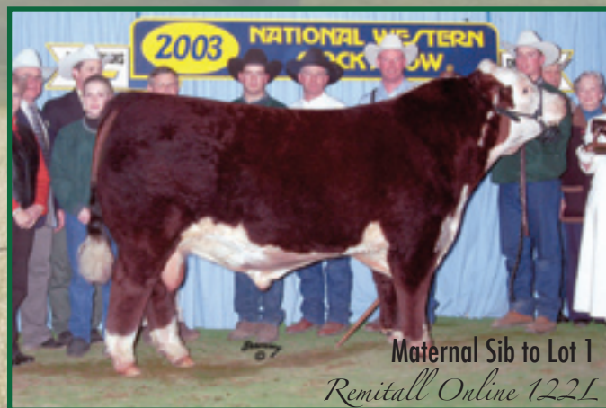
Maternal Sib to Lot 1 Remitall Online 122L