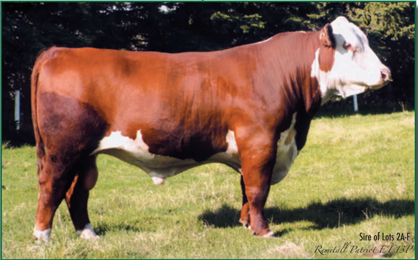
Sire of Lots 2A-F Remitall Patriot ET 13P