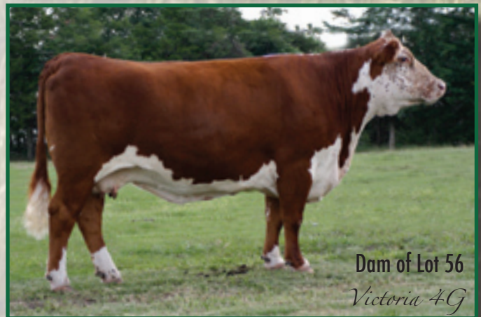
Dam of Lot 56

32N ranks in the top 20% for SCEZ and SBII.