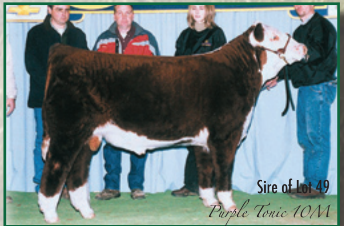
Sire of Lot 49 Purple Tonic 10M

145S is a Purple Tonic 10M daughter that ranks in the top 5% for RE, top 10% for SCHB, and top 20% for SBMI and SCEZ.