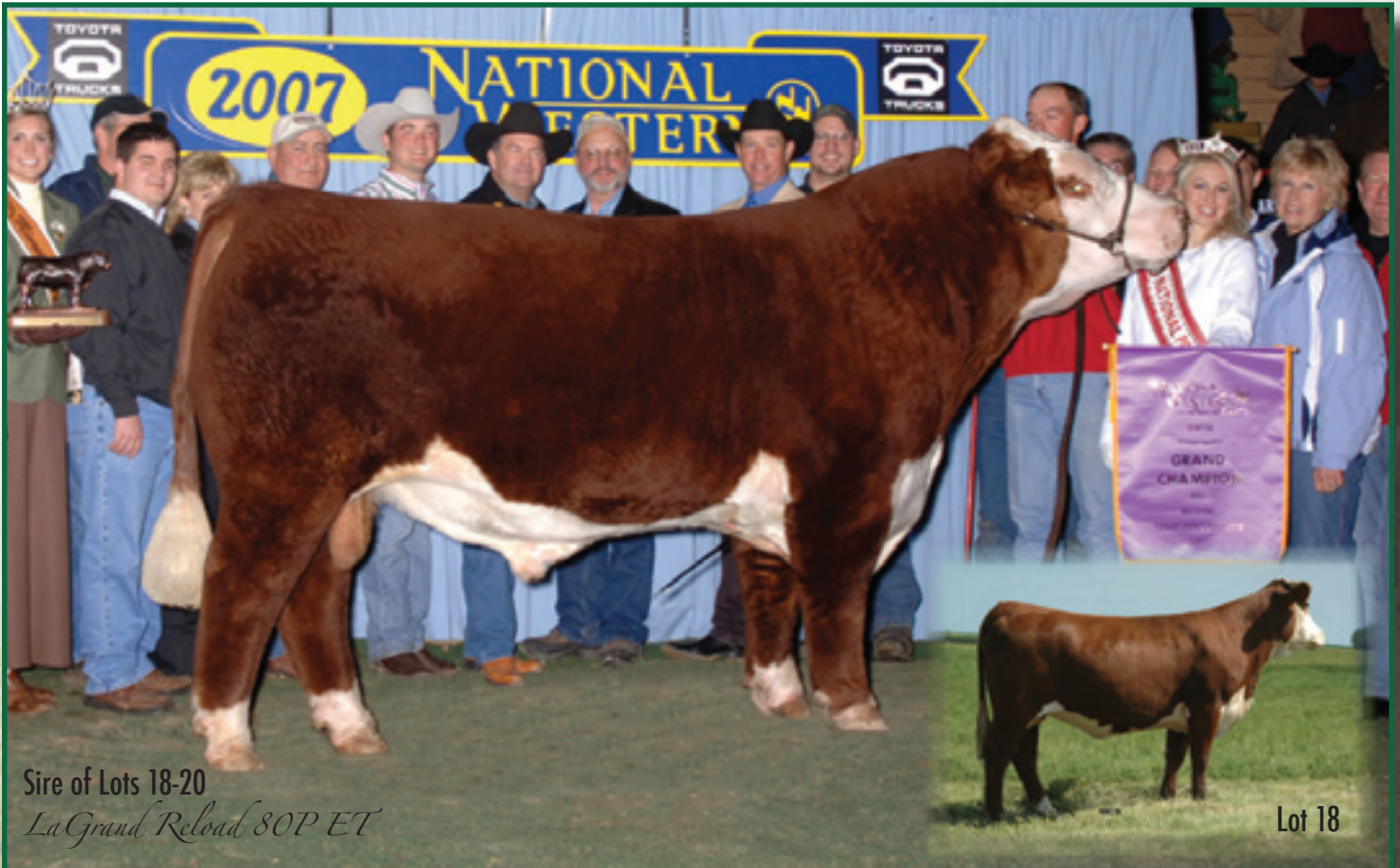
Sire of Lots 18-20 LaGrand Reload 80P ET