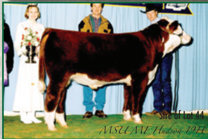
Sire of Lot 44